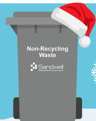
Non recycling (grey) bin