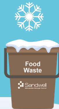
Food waste (brown) bin