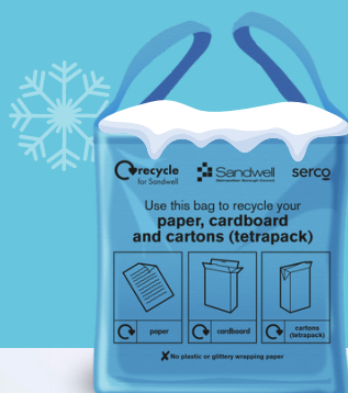
Recycling (blue) bag