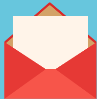
Non-glitter paper Christmas cards