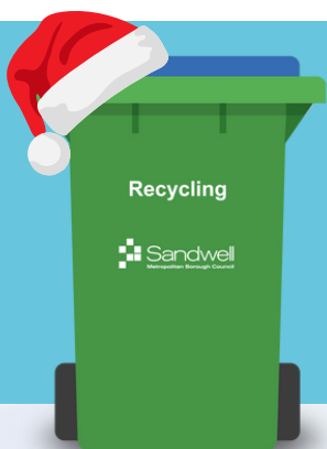
Recycling (blue lid) bin