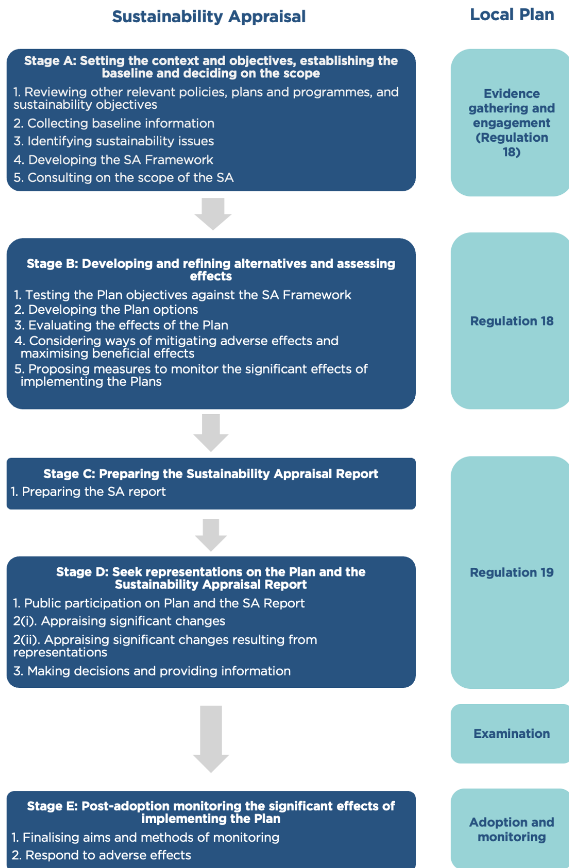
Figure 1.2: Sustainability appraisal process