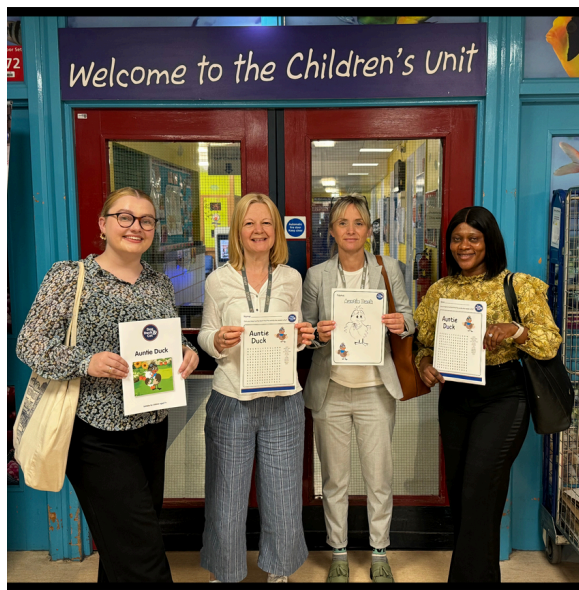
The Air Quality team at the children's unit, Sandwell General Hospital