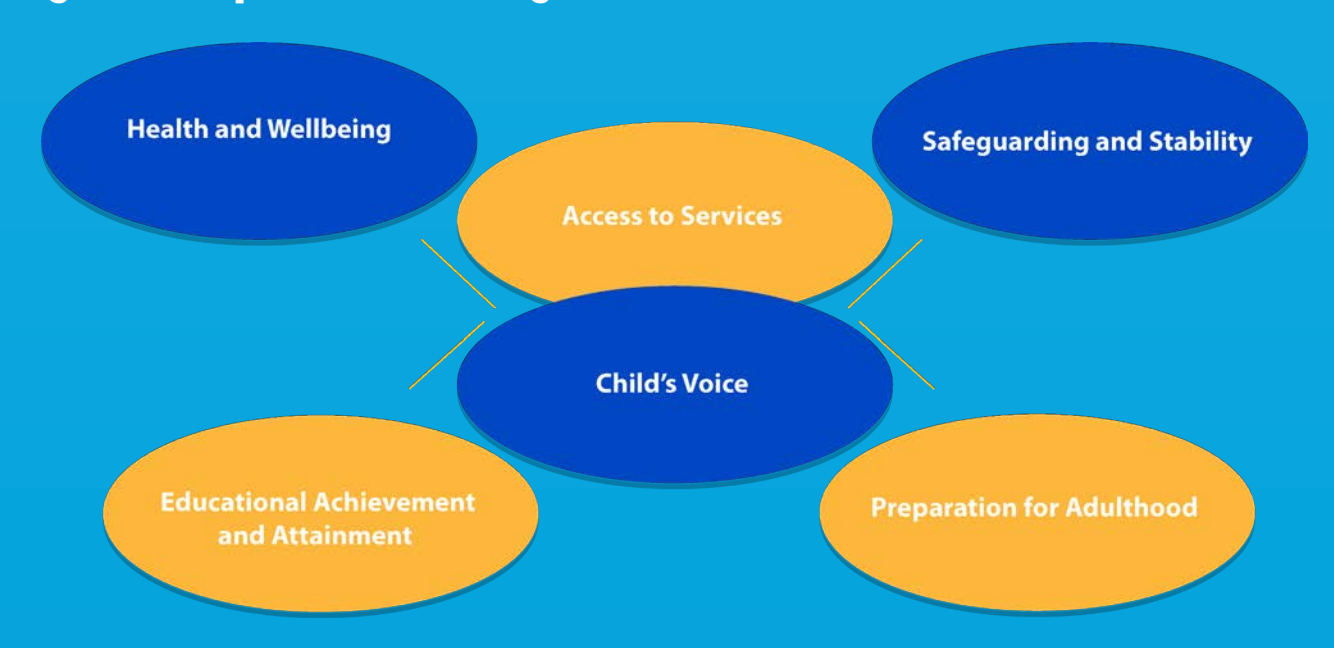
Diagram: Corporate Parenting Board Workstreams

We know all of our children and young people are unique, with individual needs and circumstances. Through our Corporate Parenting Board and various young people's Forums, we work closely with our young people to understand their needs and ensure that their voice is at the centre of everything that we do.