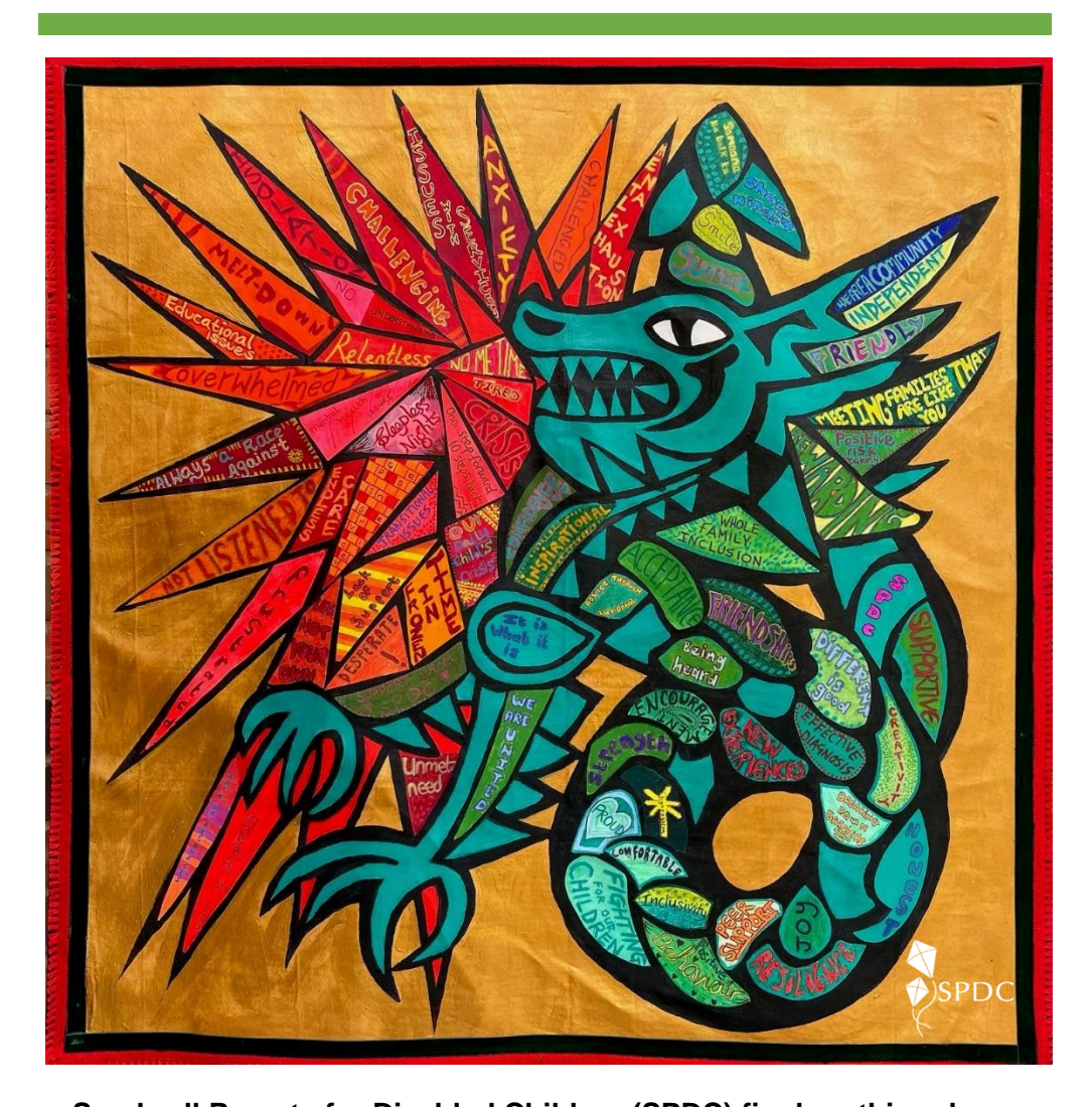
Sandwell Parents for Disabled Children (SPDC) fire breathing dragon