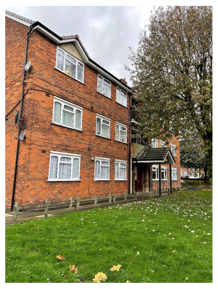
Cleton St, Tipton, DY4 7TR