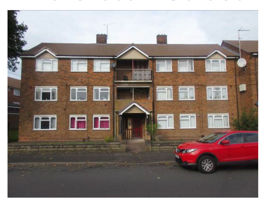
Cleton St, Tipton, DY4 7TR