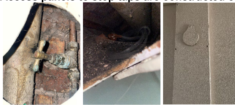
(Conformation of appropriate fire stopping received from Fire Rapid Response Team)

8) Access panels to stop taps are constructed of timber ply.