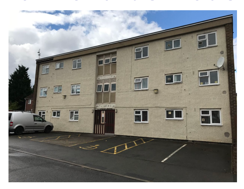
Kempsey close, Oldbury, B69 1BN